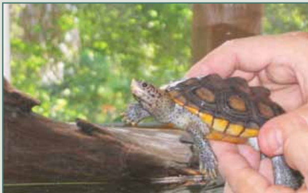
Ornate Diamondback Terrapin.

EE staff works diligently to build the relationship between conservation and businesses. SCCF preserved lands are a unique feature of the islands' landscape and are integrated into the visitors' positive perception of their experiences. The realtor education workshops and classes continue to demonstrate the close ties between conservation, quality of life and real estate values.