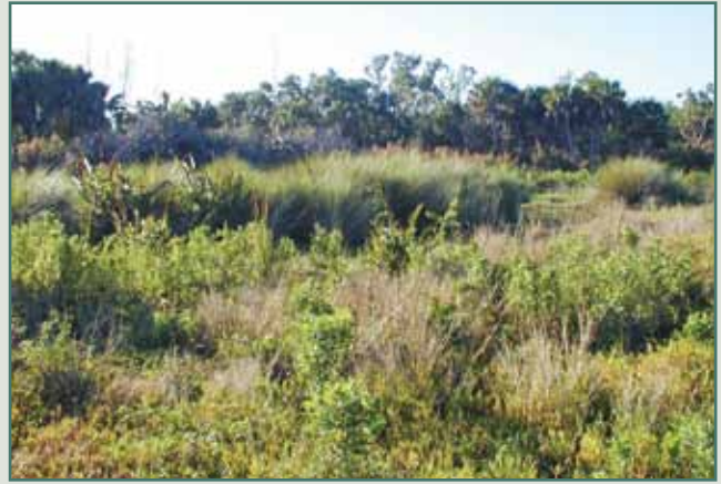
Photo Plots. Left: Frannie's Preserve on 7/6/00, just after the removal of Brazilian Pepper. Right: on 1/24/06.