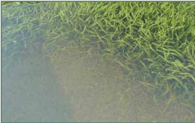
August 2010: Photo of healthy stand of tapegrass on the south shore of the Caloosahatchee upstream of the W.P. Franklin Lock & Dam. Shorter grass in the foreground has been grazed by manatees.