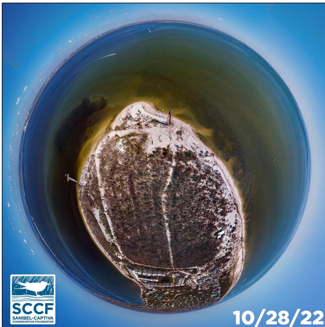
Water clarity at Lighthouse Beach Park on 10/28/22 at 1:39 PM on a rising tide (high tide: 1.97 ft @ 4:47 PM). Lighthouse Beach Park Virtual Tour.

Data are provisional and subject to change.